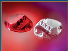
Can be coloured