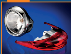
Low volume end use